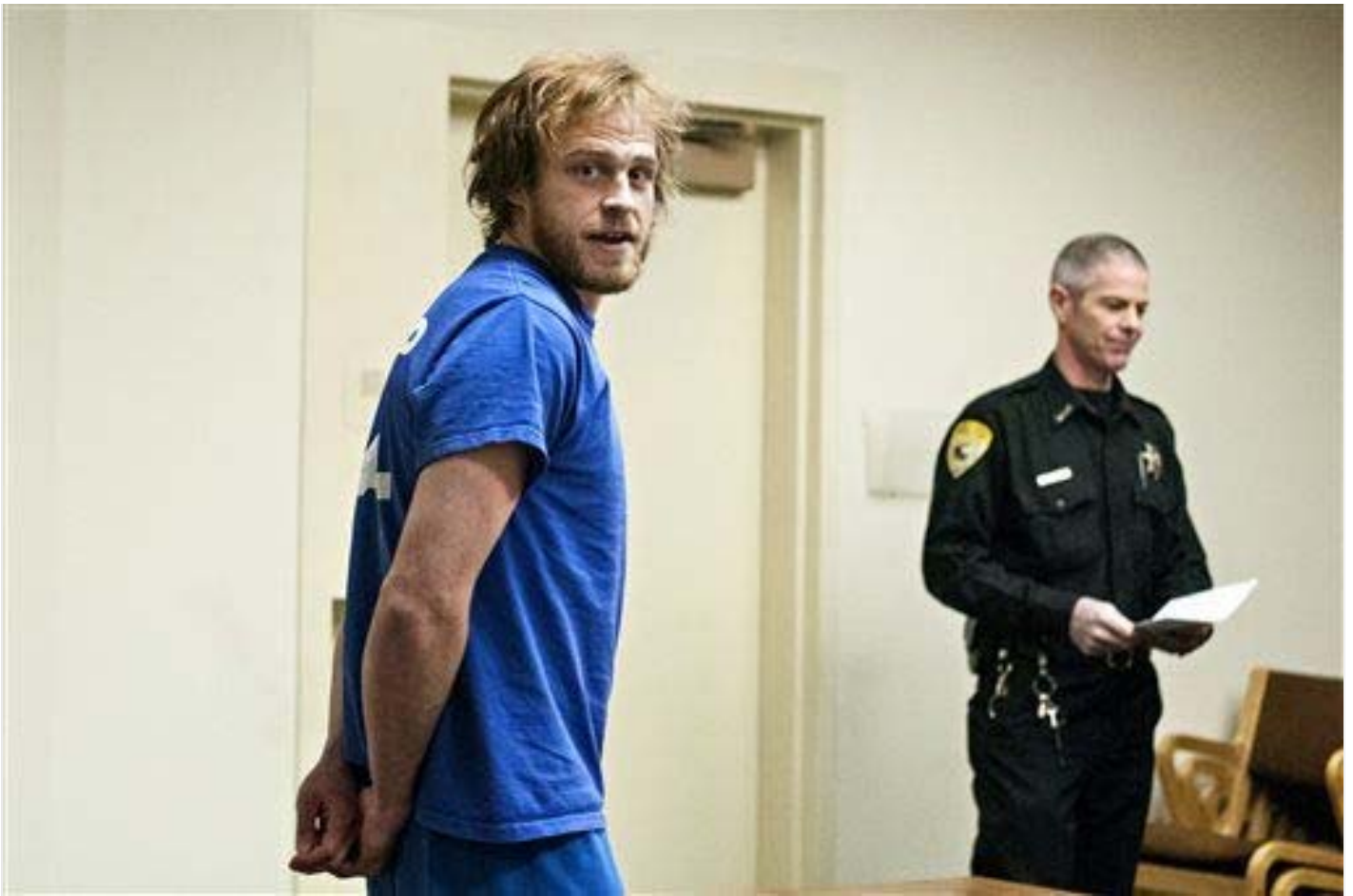
Man accused of threatening to kill Kalispell children wants charges dropped