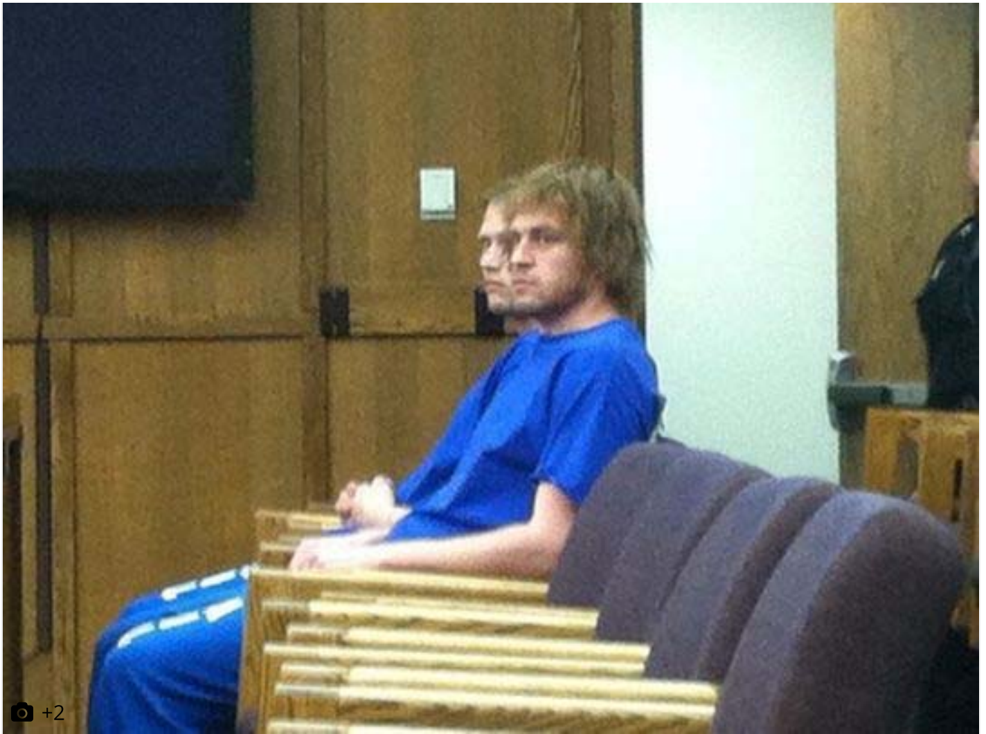
Man accused of threatening Kalispell schoolkids pleads not guilty