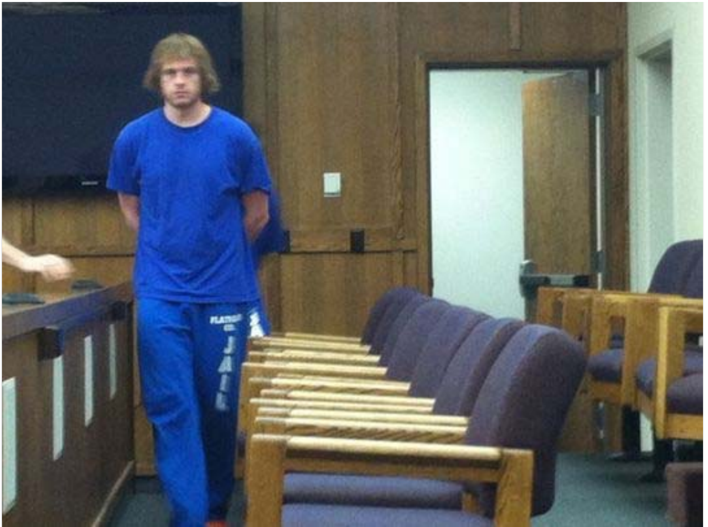
Kalispell man accused of threatening schools released to custody of parents