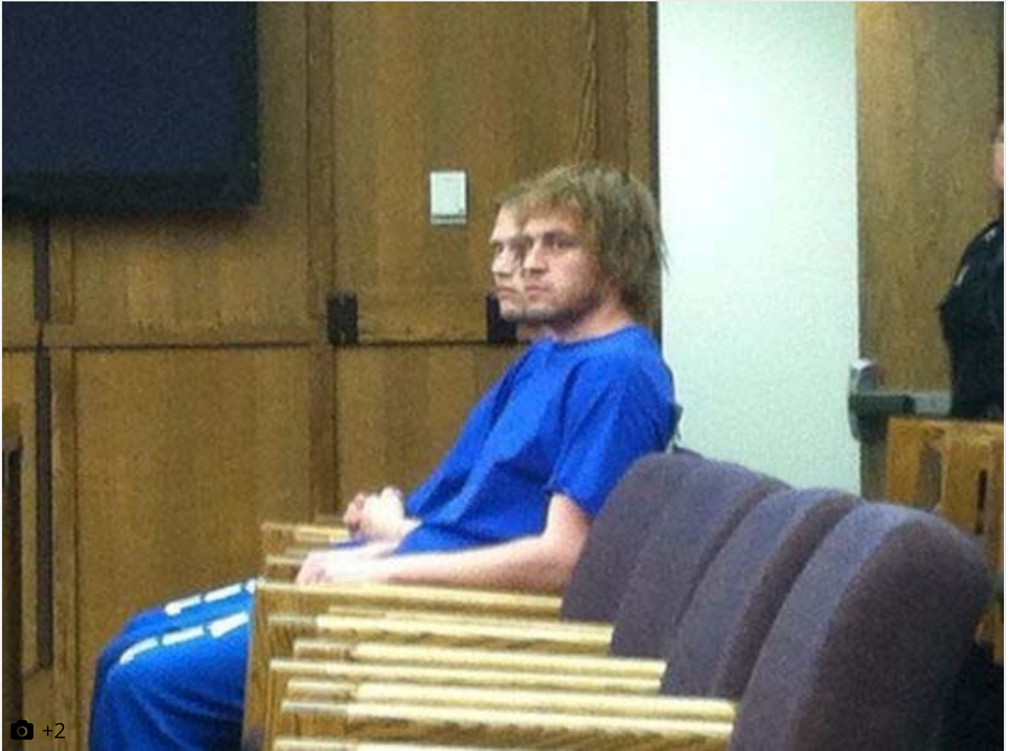
Plea deal could be in works for man accused of threatening Kalispell students